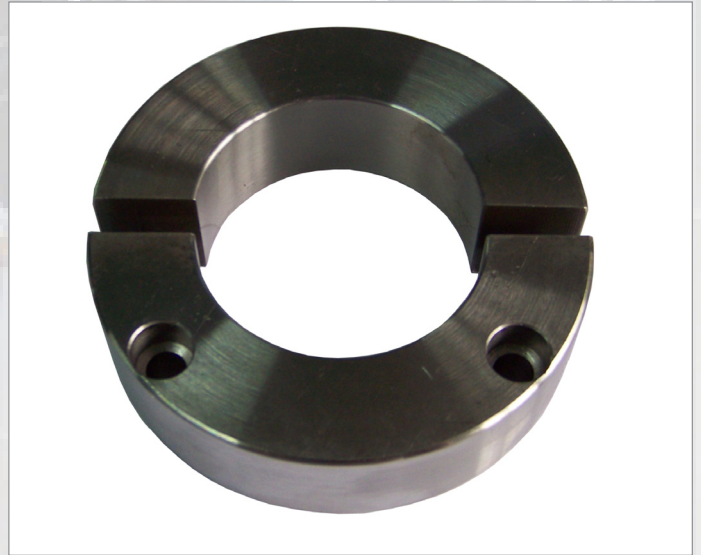
Collet / OD Mounting Saddles