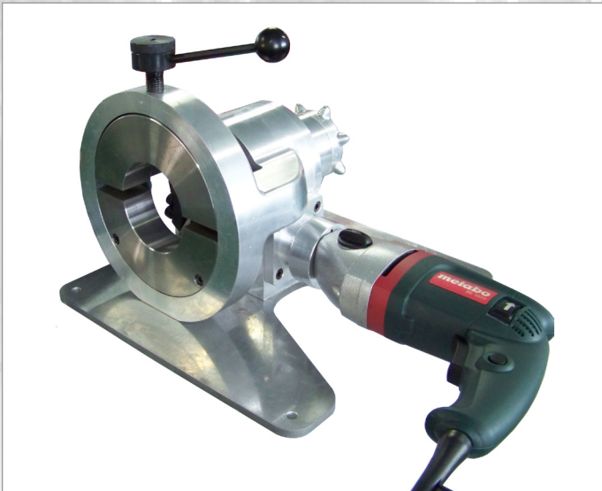
SquareDevil (front view)