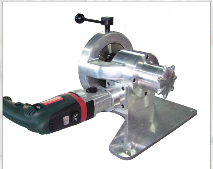
SquareDevil (back view)