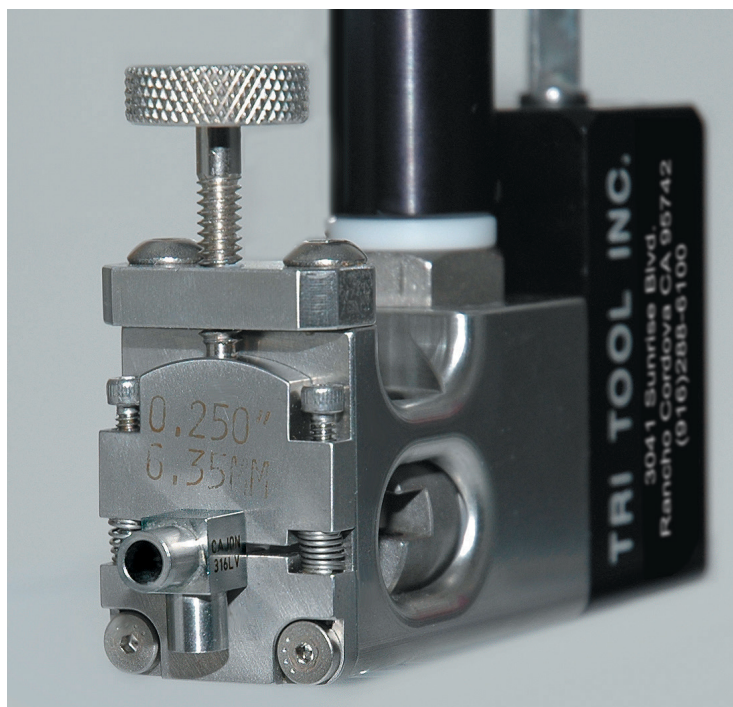
The MicroFacer can produce excellent end preparation on straight lengths of tubing as well as microfittings. Stainless self-contained saddle sets make changing from one size to the next quick and easy.

A wide selection of stainless saddle sets are provided for any tubing size or microfittings you are working with.