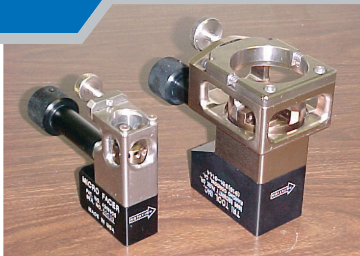
The difference between the Model 300 (.75" max) and Model 320 (2" max) tube squaring machines is very apparent. Despite the size difference, both machines perform in exactly the same manner.