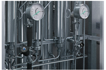
Working in confined gas cabinets is where the compact size of the MICROFACER is ideal.

Delivering big precision in a small package, it's perfect for confined spaces.